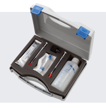
Industrial Legionella Field Test